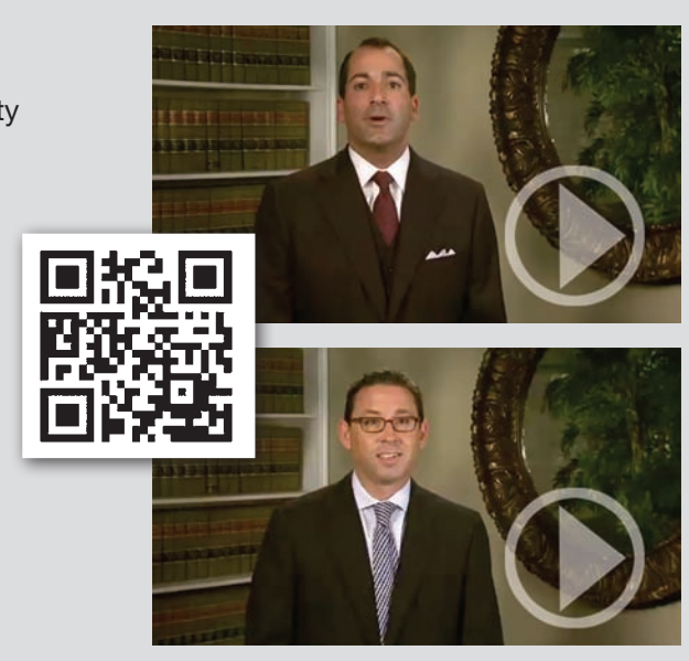
SCAN with a Smart Device: Phone, Tablet. For more information: www.quikqr.com

The resource section of our website also provides informative brochures, a comprehensive list of helpful websites and a frequently asked questions section. ■