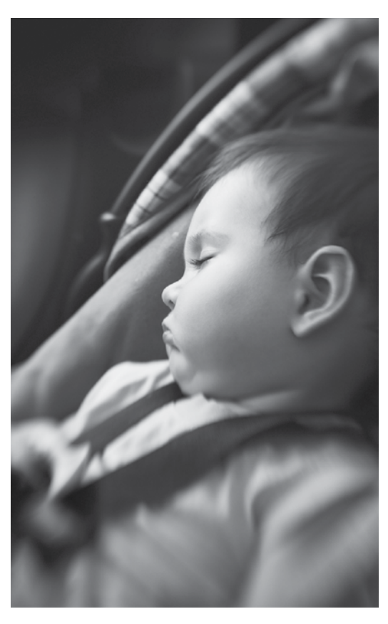
Brought to you by the law firm of Murray Guari Trial Attorneys PL

A guide to proper use of child safety seats