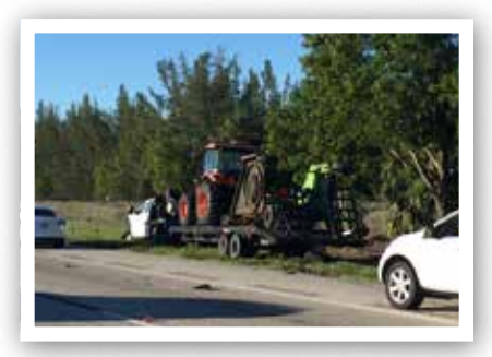
At-fault vehicle, with fully loaded trailer.

helping them get full and just compensation for their injuries and human losses caused by the negligence of others.