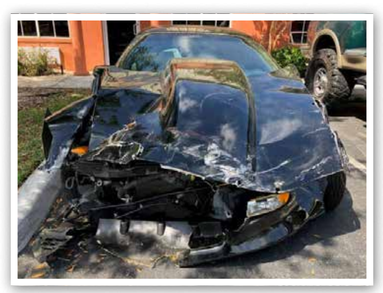
Our client's vehicle.

If you or a loved one have been hurt in a motor vehicle crash, it is vital that you have attorneys who are willing to fight for fair and just compensation and who are willing to file a lawsuit when the insurance companies refuse to act fairly, like Murray Guari Trial Attorneys.