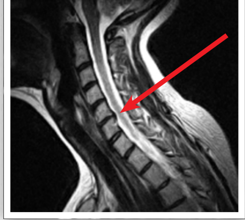
Photo of our client's vehicle (left) and her MRI image showing a clear herniation at C5-6 (right).

downtown West Palm Beach, Florida. She was immediately transported from the scene for injuries to her neck and back, as the heavy crash resulted in the vehicle being declared a total loss. After substantial, conservative medical treatment consisting of MRIs, physical therapy, and injections, our client underwent a one level, cervical fusion surgery (ACDF). Fortunately, the surgery ultimately helped resolve her pain and symptoms from the crash.