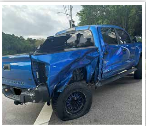
Our client's vehicle (left) the at fault driver's vehicle (right).

Disclaimer: Each case is unique, and the results in one case do not necessarily indicate the quality or value of another case.