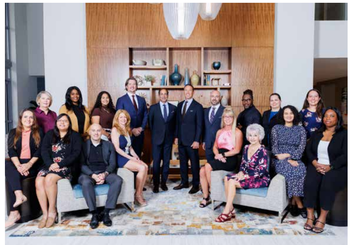
Our Dedicated Team