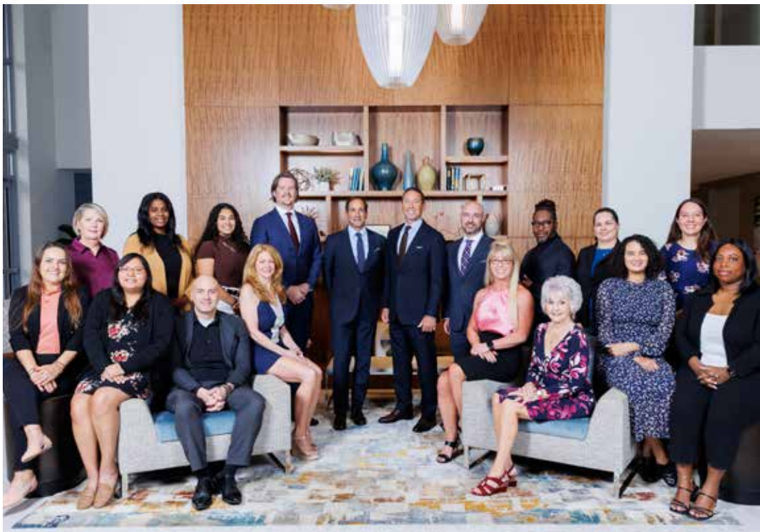
Our Dedicated Team

Our team's loyalty and longevity speak volumes about our firm's commitment to fostering a positive work environment where professionals can grow and thrive. As we look forward to the next 20 years, we know that our continued success will be built on the foundation of our extraordinary team's dedication and hard work. ■